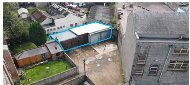
City Centre > Detached unit To Let > 1,195 sq ft