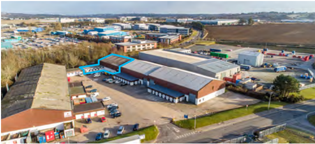
Dyce > Terraced unit To Let > 9,170 sq ft