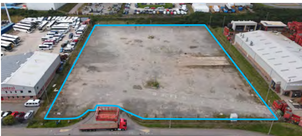
Altens > Hardcore Storage Yard To Let > 2.64 acres