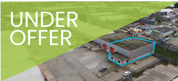
Bridge of Don > End terraced unit To Let > 5,138 sq ft