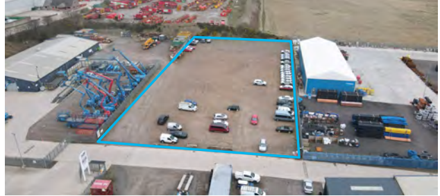
Marywell > Hardcore Storage Yard To Let > 1 acre