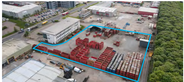
Altens > Concrete Storage Yard To Let / May Sell > 1.95 acres