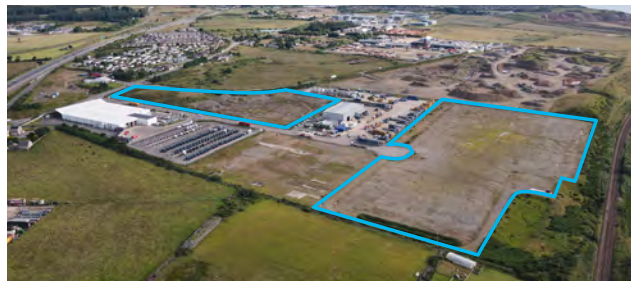
Marywell > Commercial Development Sites > From 2 – 10 acres