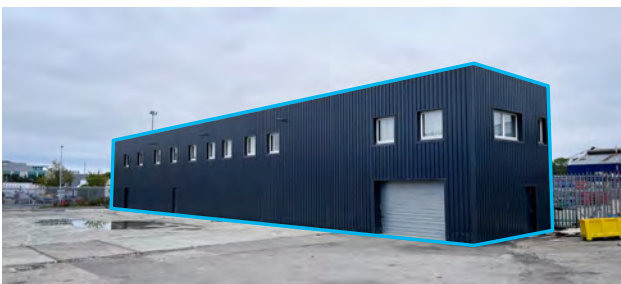
Dyce > Detached unit To Let / For Sale > 4,814 sq ft