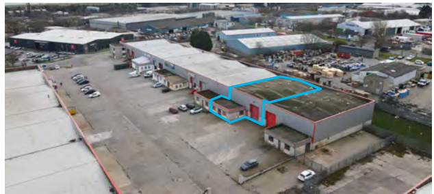
Bridge of Don > Mid terraced unit To Let > 5,138 sq ft