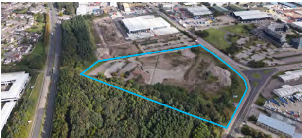
Crawpeel Road, Altens > Commercial Development Sites For Sale > From 2 – 8 acres