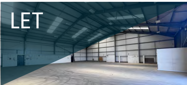
Marywell > Semi-detached unit To Let > 8,295 sq ft