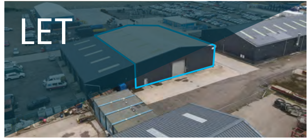
Marywell > Semi-detached unit To Let > 7,906 sq ft