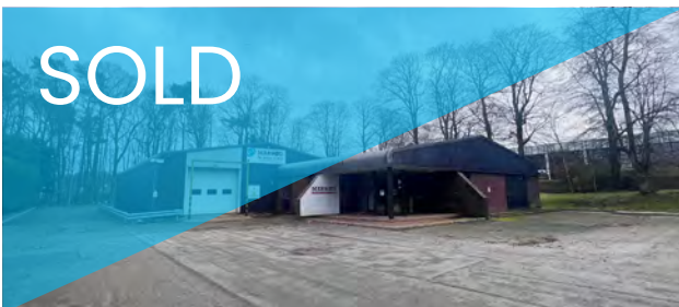
Dyce > Detached unit For Sale > 6,201 sq ft