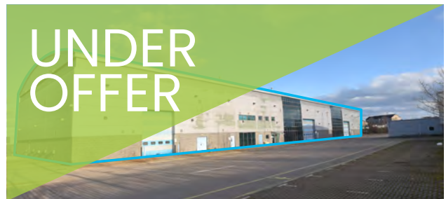
Dyce > Detached unit To Let > 39,762 sq ft