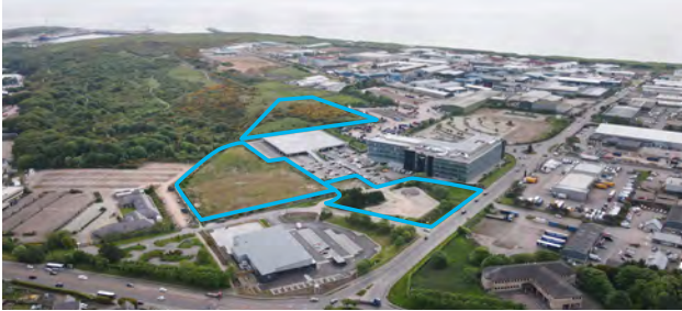
Altens > Commercial Development Sites For Sale > From 2.19 – 9.71 acres