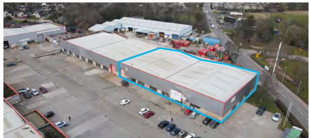
Bridge of Don > End terraced units To Let > 17,429 sq ft