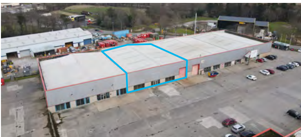
Bridge of Don > Mid terraced unit To Let > 8,700 sq ft