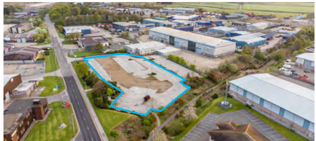
Dyce > Tarmac Storage Yard To Let > 2.15 acres