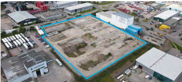
Altens > Storage Yard / Development Sites To Let / May Sell > From 2 – 4.479 acres