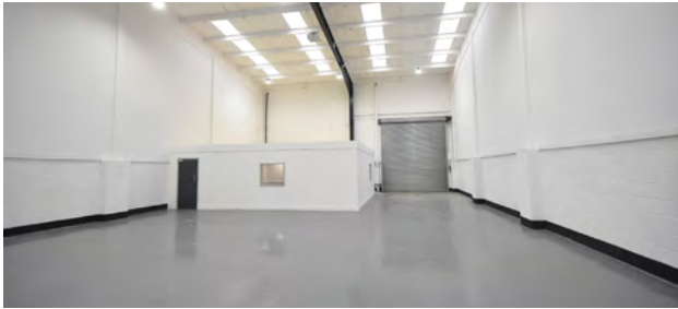
Altens > Mid terraced unit To Let > 3,964 sq ft