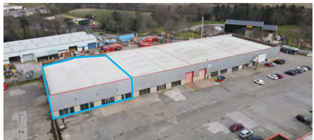
Bridge of Don > End terraced unit To Let > 8,576 sq ft